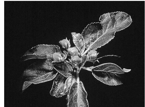
6 – Pink