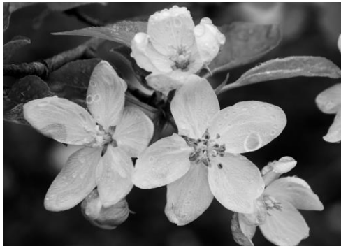
7 – Bloom