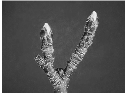
2 – Silver Tip