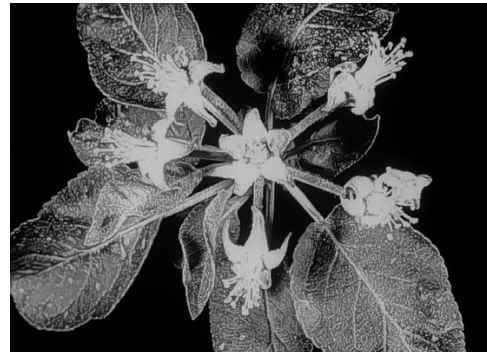
8 – Petal Fall