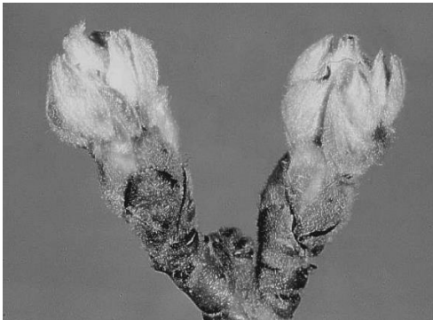
4 – Half-Inch Green