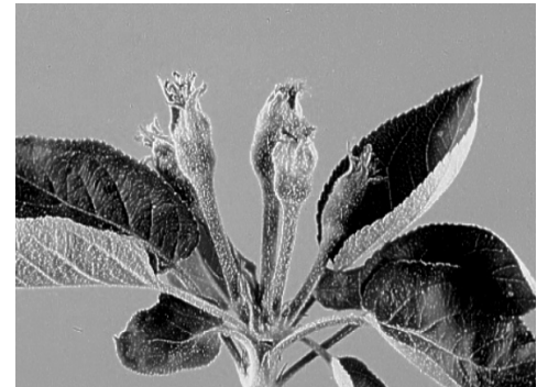
9 – Fruit Set