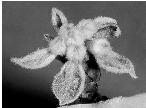
5 – Tight Cluster